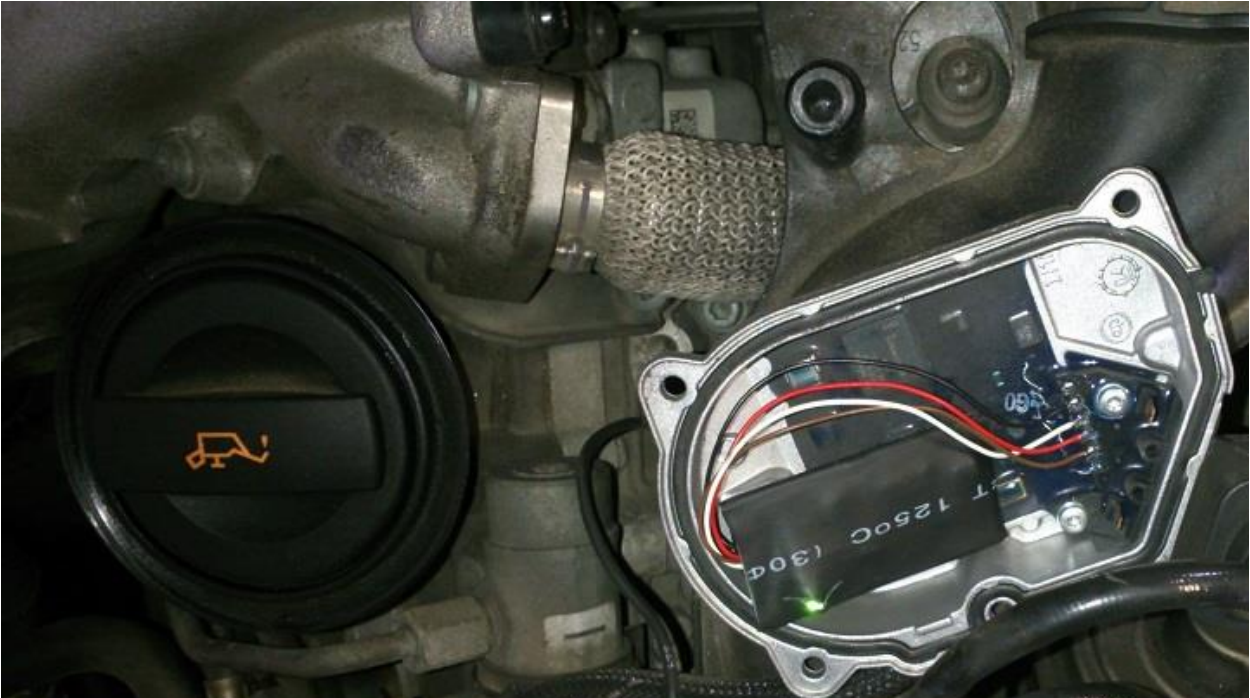
Then use the free space where the motor used to be to accommodate the emulator.