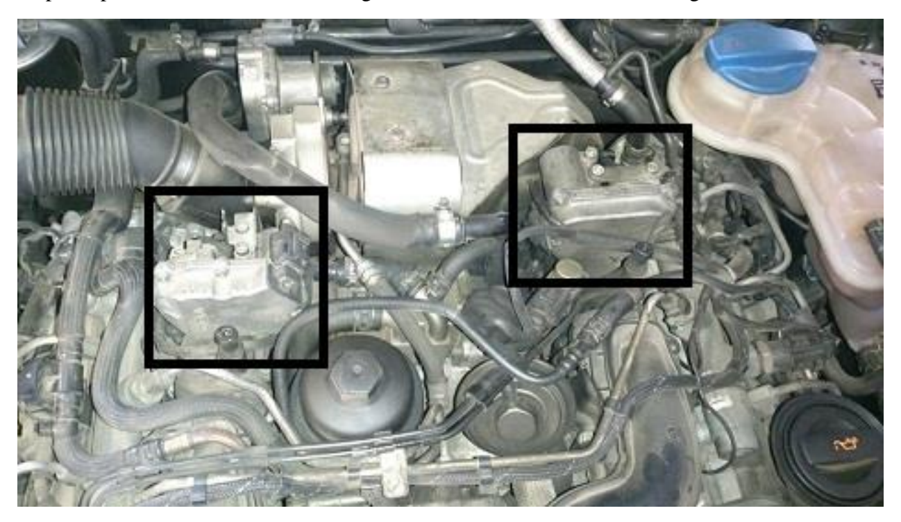
Step 1. Open the hood. Take off the engine cover. You should see something like this:

The inlet manifold flap motors are clearly marked. Undo the bolts and remove the flap connector. Remove them from the engine bay.