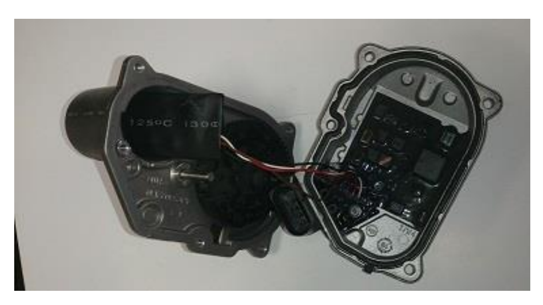
Step 5. Assemble everything back in reverse order except the motor.

Step 6. Install the device back into the car. Use the diagnostic device to determine whether there are any faults present. Is so, erase them. After that the installation is complete.