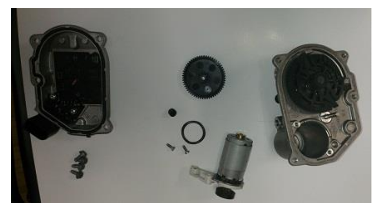
Step 4. Take the top part (the one with the electronic connector). Disconnect the unnecessary wires. Then, using the provided schematics, you will need to solder the new wires onto the free slots.